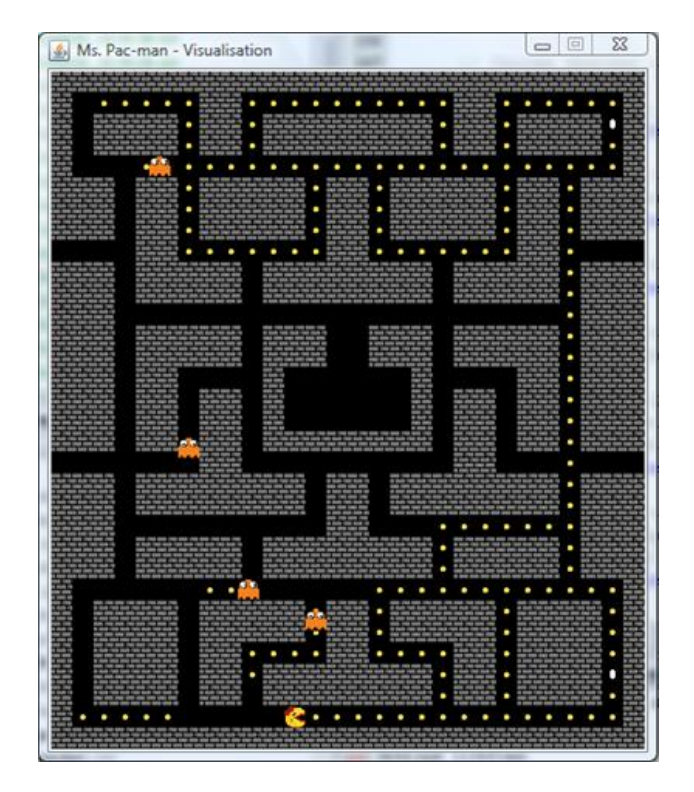
Figure 1. Screenshot of the game simulation in the first maze. The maze structure matches that of the first maze in the original game.

We developed a framework that implements a simulation of the game (see figure 1), holding a representation of all agents and objects, and their properties and states. A number of input algorithms were designed that transform the in-game situation into numeric feature input values. At every time step, neural networks generate a decision on which action to take by propagating the input through the neurons. When a move is